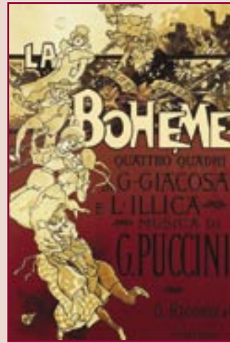
Poster for the 1896 production for Puccini's La Bohème